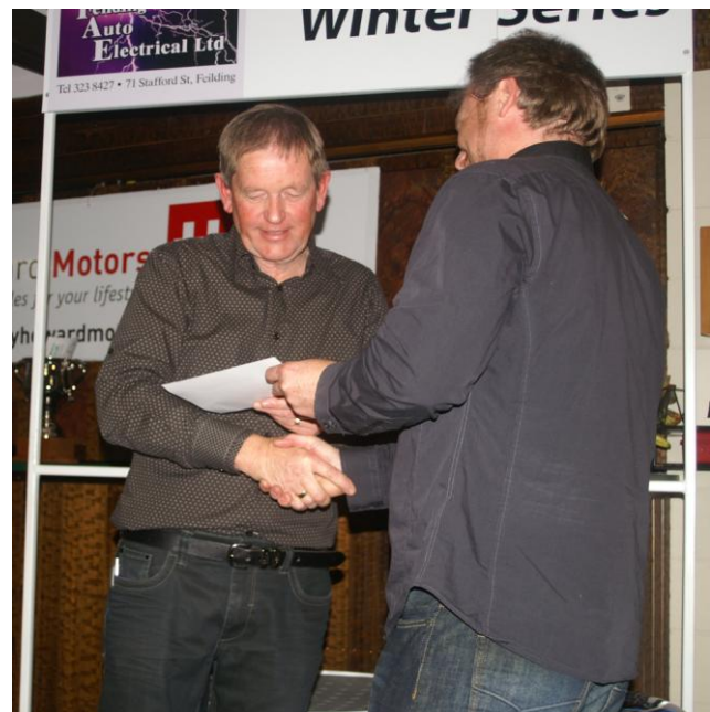
Our very own Editor receiving an award, ask him what for...