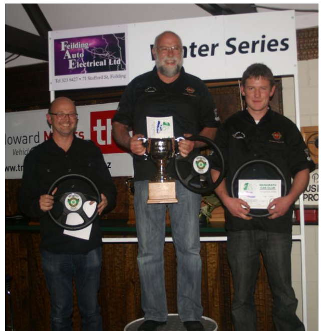
The Boss 1 st , Apprentice 2 nd ...