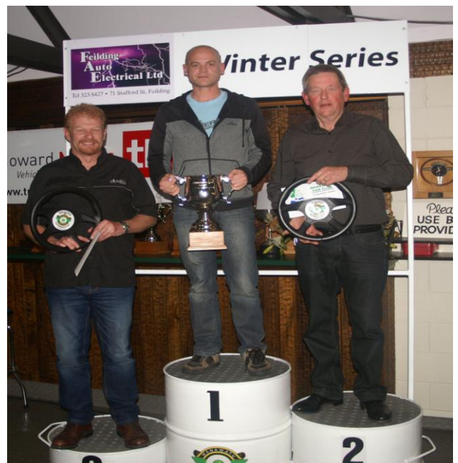
European Cup Winners