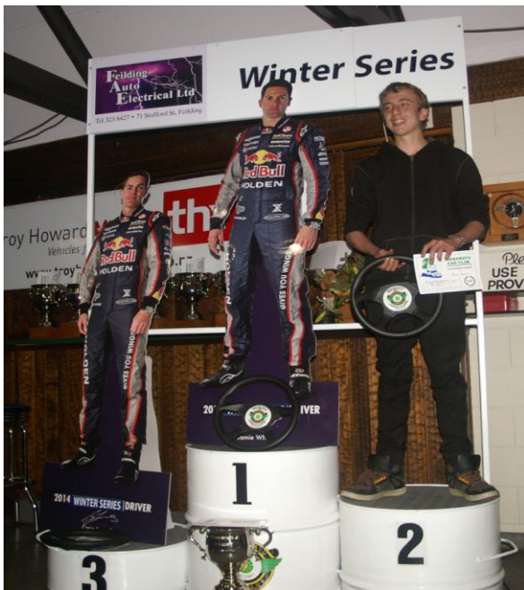
Formula Libre... with a couple of ring-ins