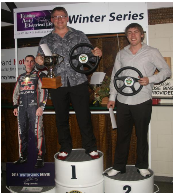
The MX5 Cup boys... check out the shoes!!!