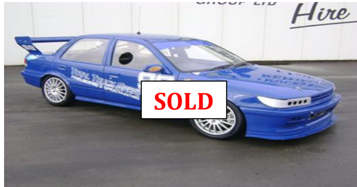
For Sale: Mitsubishi EVO 7 Trade Me Reference: #686971388

Do you have a race car or race parts "FOR SALE" and want to get it out to as many people as you can. Drop us a line to manawatucarclub@xtra.co.nz with a brief description of the car or the part/s you have for sale and your contact number and we will include it in our newsletter when we can.